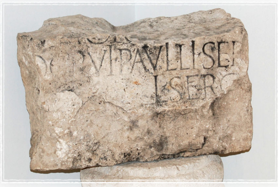
Sergius Paulus Inscription