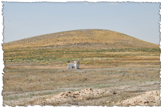
Ruins of Derbe