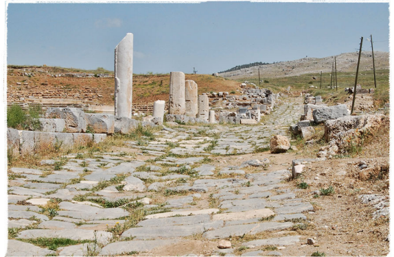
Ancient Streets in Antioch of Pisidia