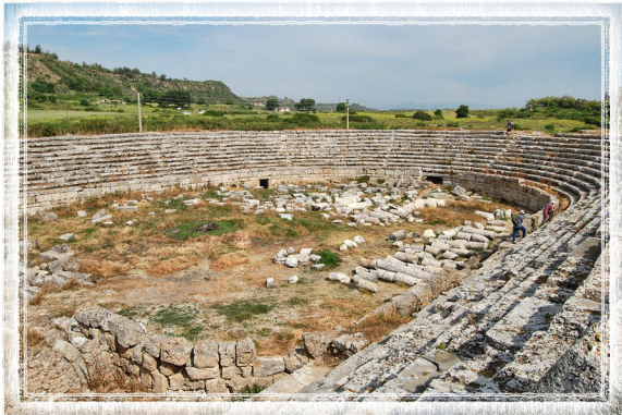
Stadium at Perga