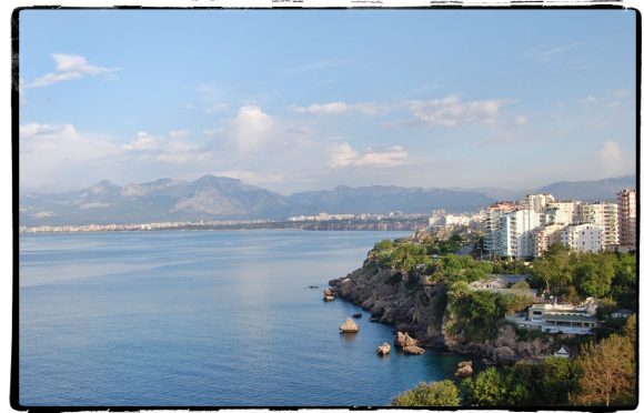
Taurus Mountains viewed from Antalya