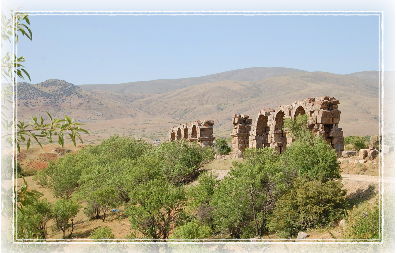
Roman Aqueduct at Antioch in Pisidia

“But when the one who set me apart from birth and called me by his grace was pleased to reveal his Son in me so that I could preach him among the Gentiles, I did not go to ask advice from any human being, nor did I go up to Jerusalem to see those who were apostles before me, but right away I departed to Arabia, and then returned to Damascus.” (Galatians 1:15–17, NET)