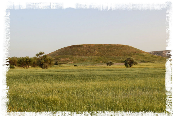
Ruins of Lystra