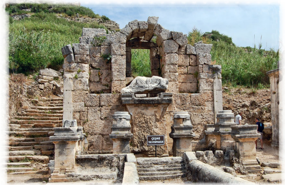
Monumental Fountain at Perga