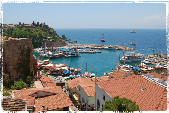
Harbor at Antalya